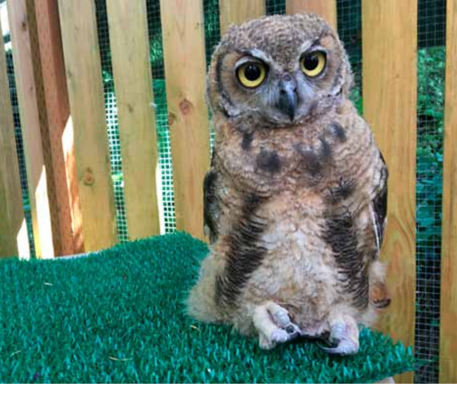
Above: Neville using the crate as a nap space. Below: First crate set-up for Neville.

side of the crate's entrance. Once he was targeting to the entrance mat, as well as into and out of the crate without a lure piece, we decided to modify the crate so that it was travel-ready. We added a solid door (coroplast placed over the wire Vari-kennel standard), installed a perch, and built a small table to keep the crate a foot or so off the ground. Since the crate