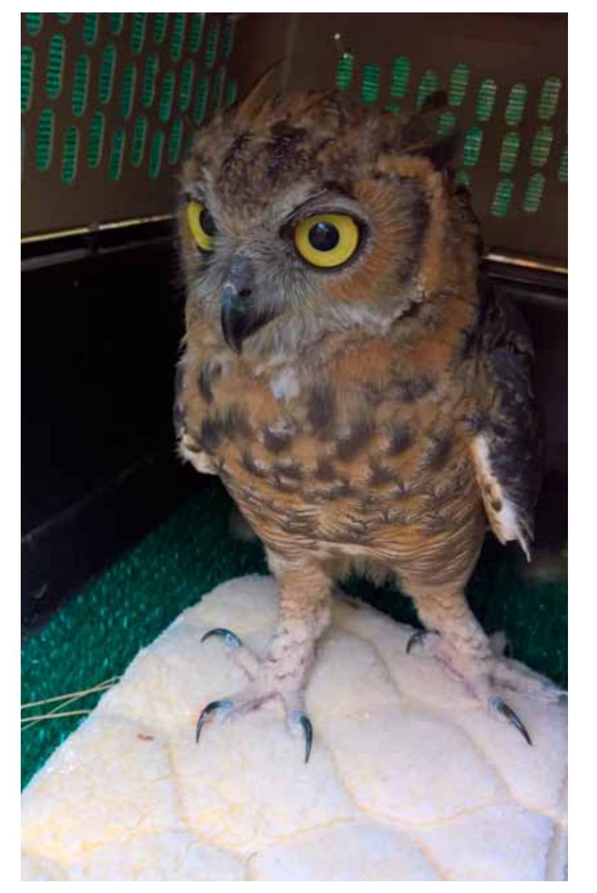
Baby Neville checking out his crate.

We carried the crate into our 16'L x 8'W x 10'H new resident outdoor assessment and quarantine aviary, which is away from the bustle of the public and has two entry doors off the vestibule allowing us to maintain space away from a new bird as we enter (we can enter from the door away from where the bird is perching). We left the door off the crate for maximum clearance (instead using our bodies to block the opening as we carried it) and gave the owlet